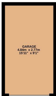
GARAGE 13.4 sq.m. (144 sq.ft.) approx.